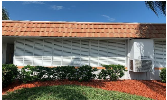
FRONT RIGHT SIDE