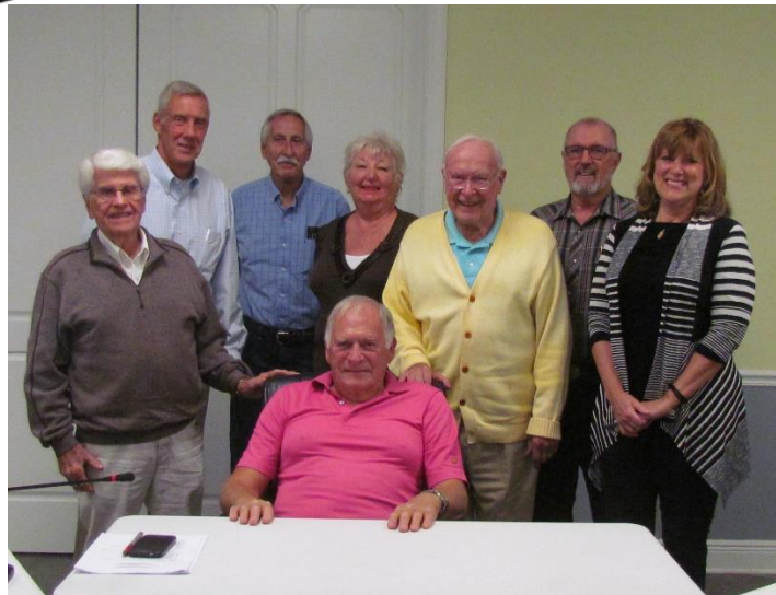
HARBOR LIGHTS 2018 CO-OP BOARD